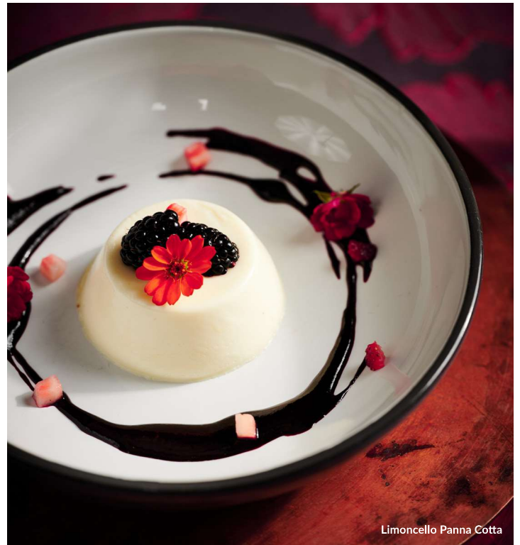
Limoncello Panna Cotta