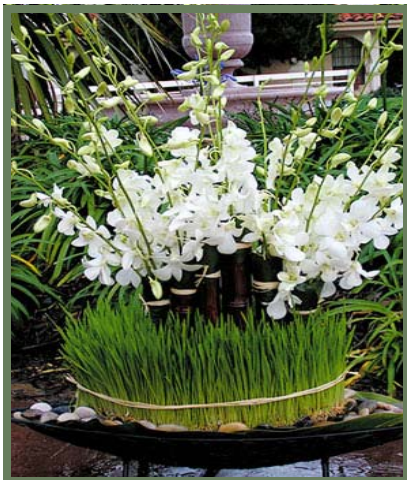
Orchid Zen Premium Arrangement