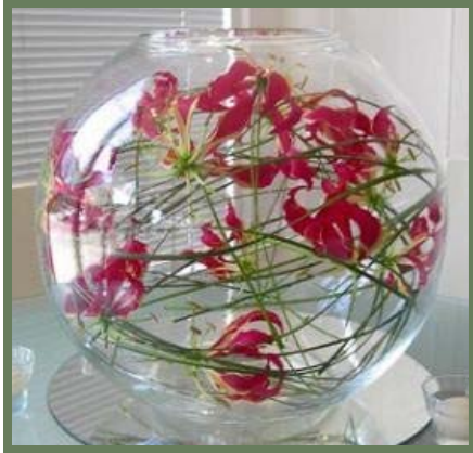
Floating Gloriosa "Bomb" Signature Seating Table Centerpiece