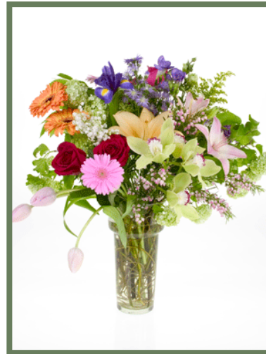
Curly Willow Vase with Summer Mix Specialty Buffet Arrangement

Buffet & Larger Arrangements: $150 to $250