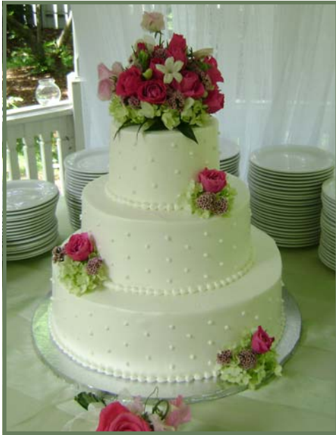
White cake with Raspberry preserves and white buttercream icing with dot pattern (fresh flower cake topper $75)