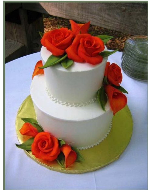
Chocolate Chiffon Cake with Raspberry Mousse Filling, White Buttercream and Brilliant Fondant Roses